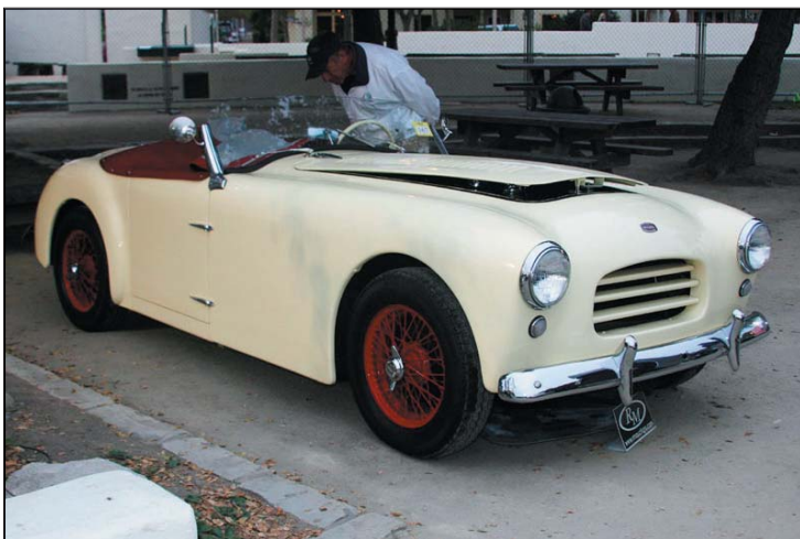
The late Tom Turner's Palm Beach sold at the RM Auction