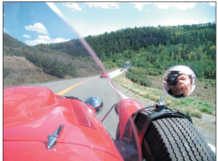
What a view!

(and a self portrait in the mirror of the photographer)