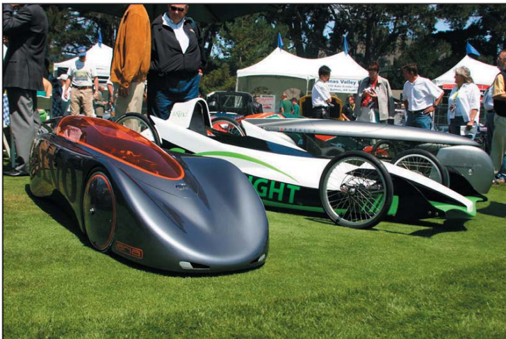
Gravity racers from the Goodwood Festival of Speed were on display after competing for the first time in America