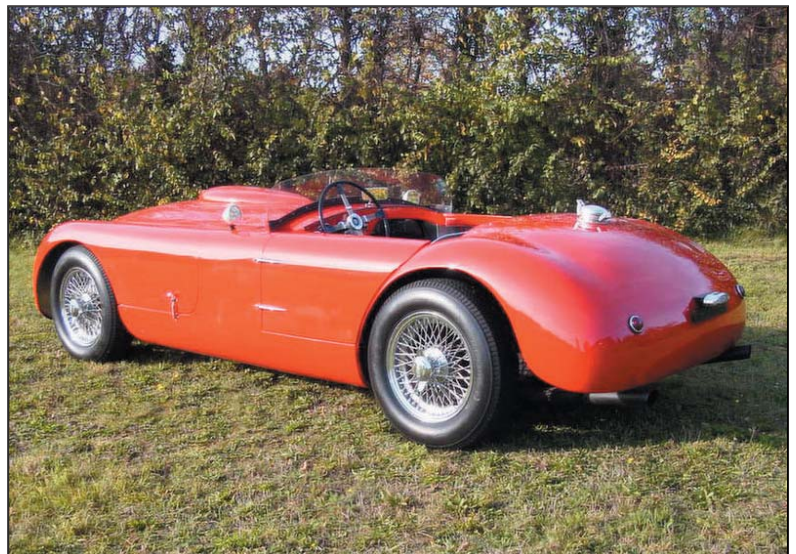
No J2X LM was alike, #3153 now resides in Germany