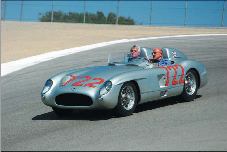
Stirling Moss and the luckiest co-driver ever, Jay Leno in the Mille Miglia winning Mercedes 300SLR .