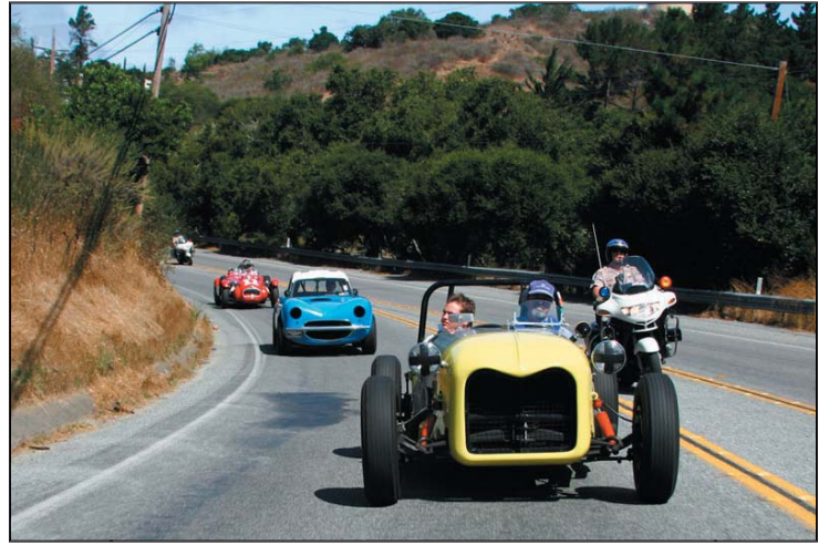
Group 3A was treated to a high speed escort by the CHP as we drove to and from the Quail.