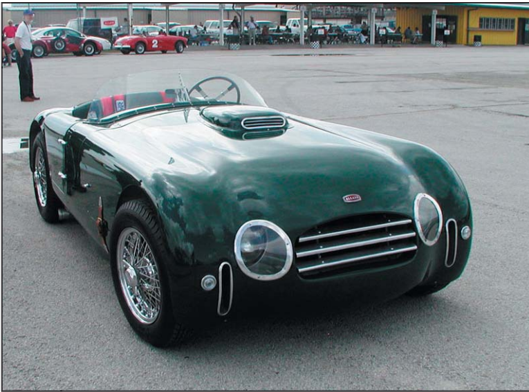
#3152 Set the high water mark for Allards in 2005

The classic car auction scene has seen a surge of interest in the Allard marque over the past couple years. Particularly, it seems, when the name Allard is tied with the magic word “LeMans.”