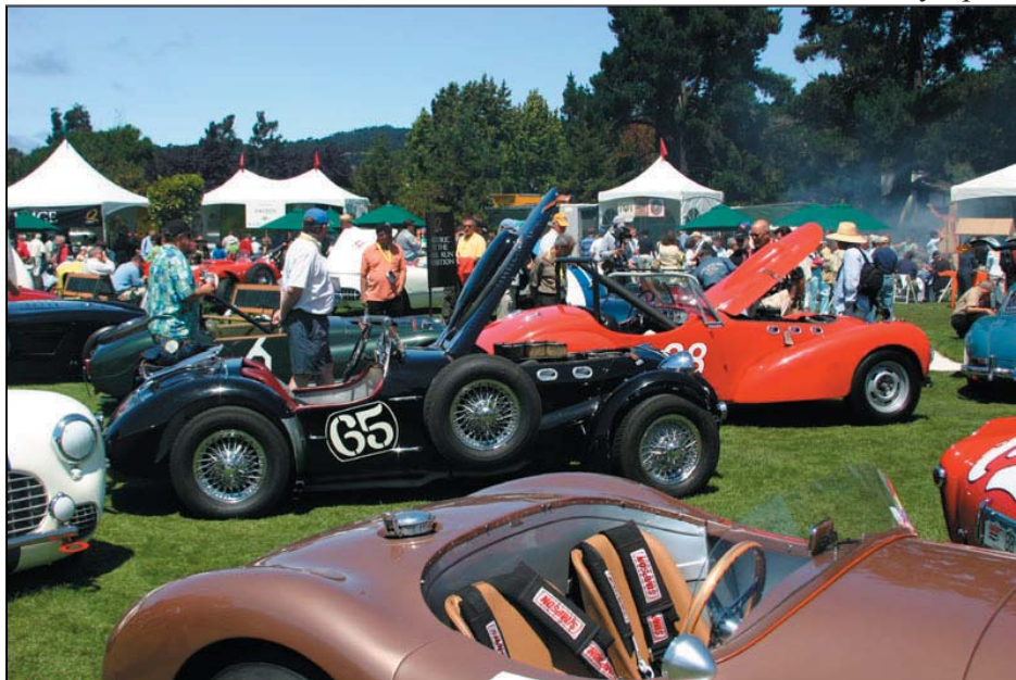
A rowdy bunch of Allards invaded the posh environs of The Quail.

Texas. They were on display all weekend, with parade and demonstration laps at the hands of Jim Hall, Phil Hill, and Vic Elford.