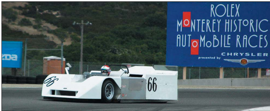
The infamous Chaprel 2J, aka "Sucker Car" in action