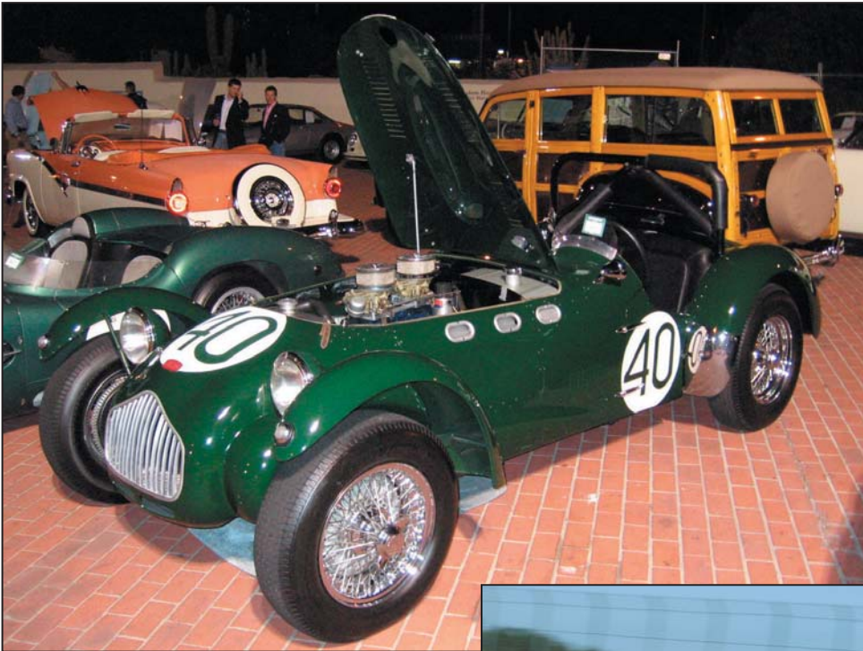
← The ex-Hichins and Reece J2 that raced in the 1951 LeMans sold for $313,500. A K2 also sold for $107,250.