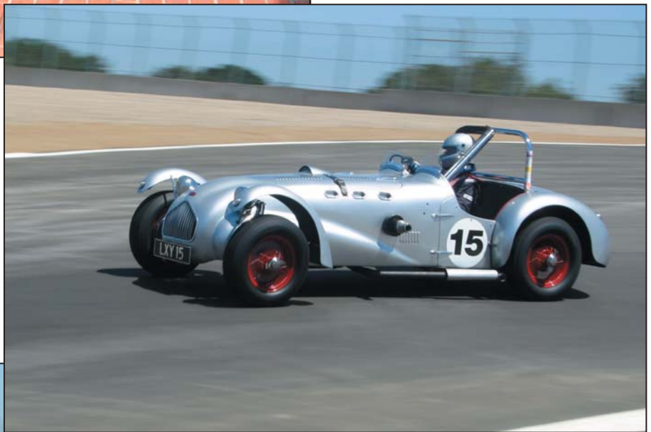
Monterey marked the west coast → debut of Brad Hoyt's recently restored ex-Cyril Wick J2