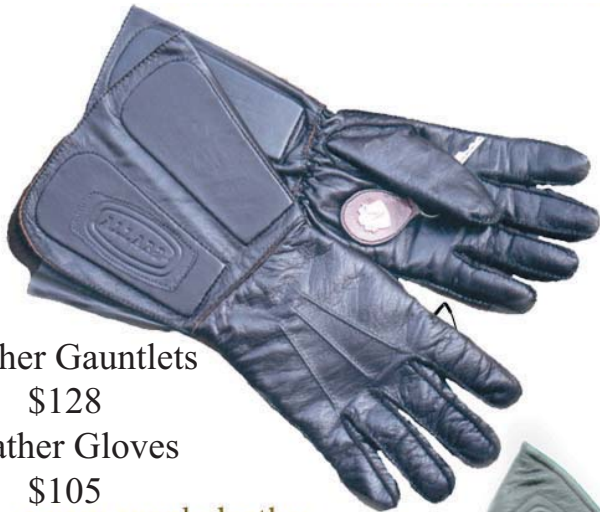
Leather Gloves $105