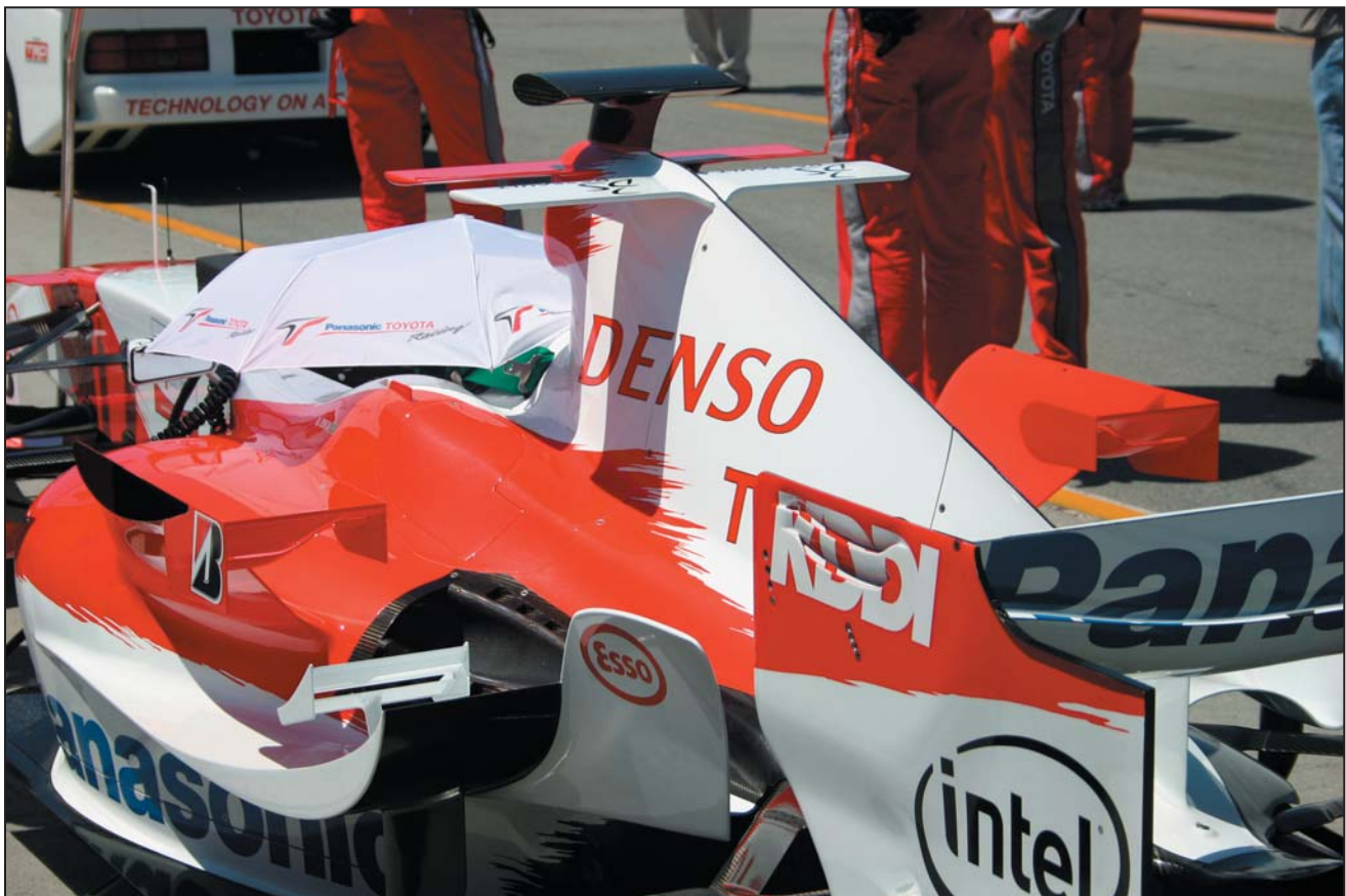
TF106 featured a dizzying array of wings. It was a unique treat for fans to view a