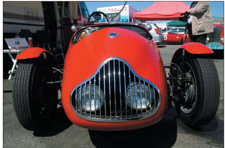
No, it's a Cooper !!!

Poster reprinted with the permission of the Pebble Beach Concours d'Elegance